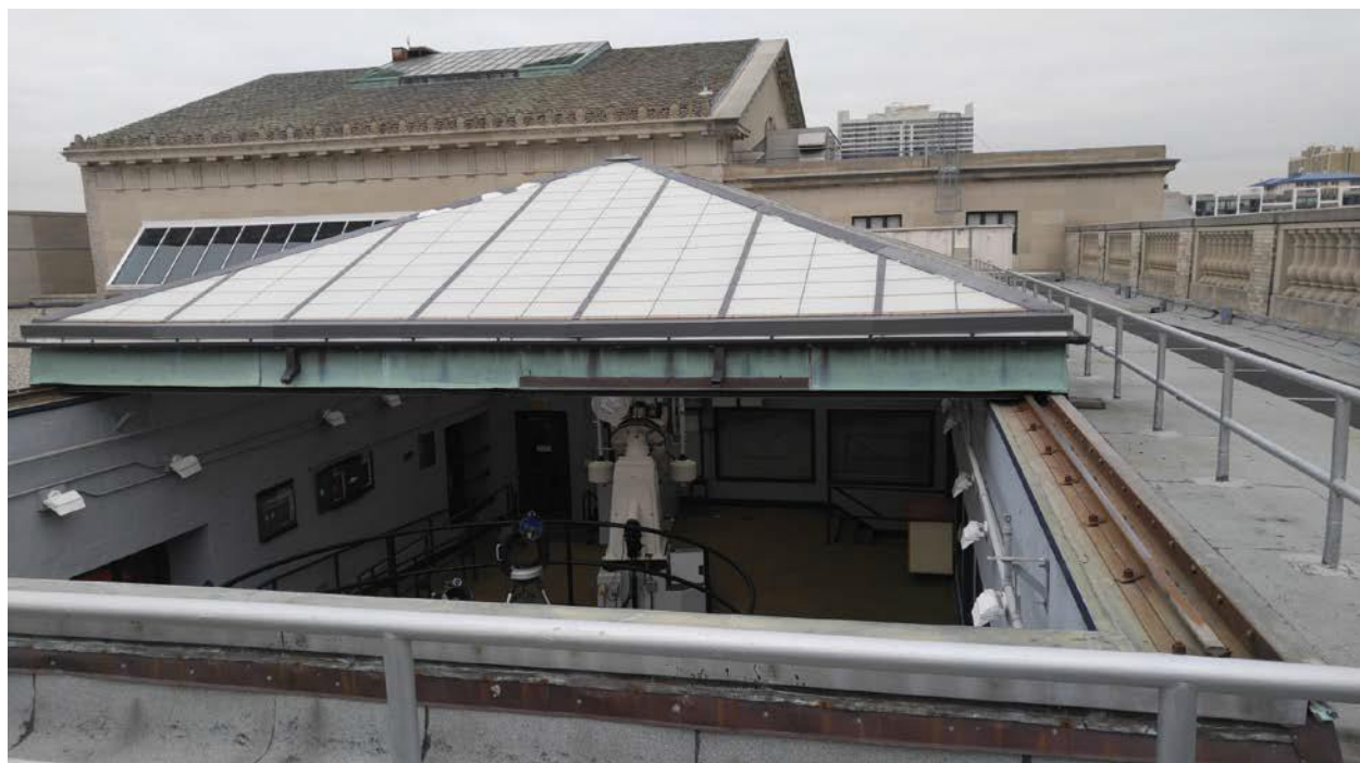
Roll Off Roof on The Franklin Institute's Bloom Observatory