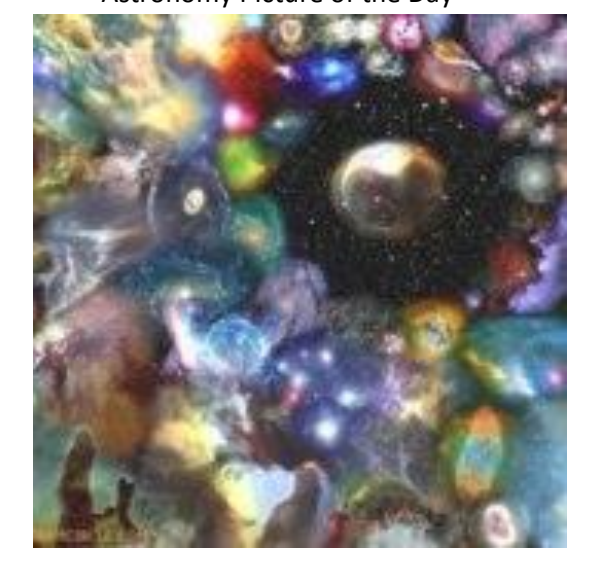
Astronomy Picture of the Day

Thus the focus of this issue of our newsletter is to highlight what has been an amazing year so far for our society meetings and community involvement. It also announces a lineup of presenters this spring that we are quite proud to bring to the astronomical community of Philadelphia and the Franklin Institute.