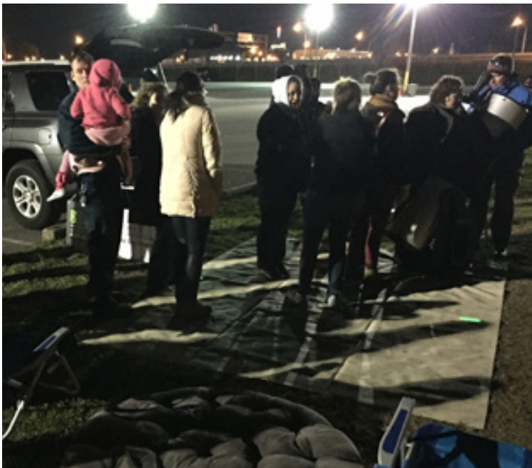
A line forms to look through the scope at Masterman Charter School

Our night could not have been better. Our host site was the Masterman Charter school who conducted the event behind their building on their playground. A wide view of sky, with few objects close by to block our horizon provided us a clear view in all directions. Weather conditions were fantastic and seeing was exceptionally clear, with little air movement, stable temperatures, and low dew points.