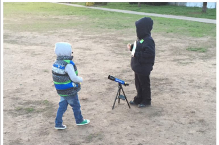
Masterman Charter School: Setting up early