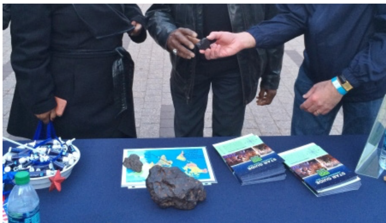
Meteorites on Display

Indeed the weather was great. The gusty winds during the day had disappeared along with the puffy clouds, leaving a really clear sky. However, even more surprising was the stable seeing. Algieba was a pair of pinpoints with a clear gap separating them. Jupiter was magnificent too. I picked it up about 7:50 pm, and using my 12.5-inch dob at 100x, there were a number of dark bands visible in addition to the North and South Equatorial Belts. The Great Red Spot was easily seen a bit east of the central