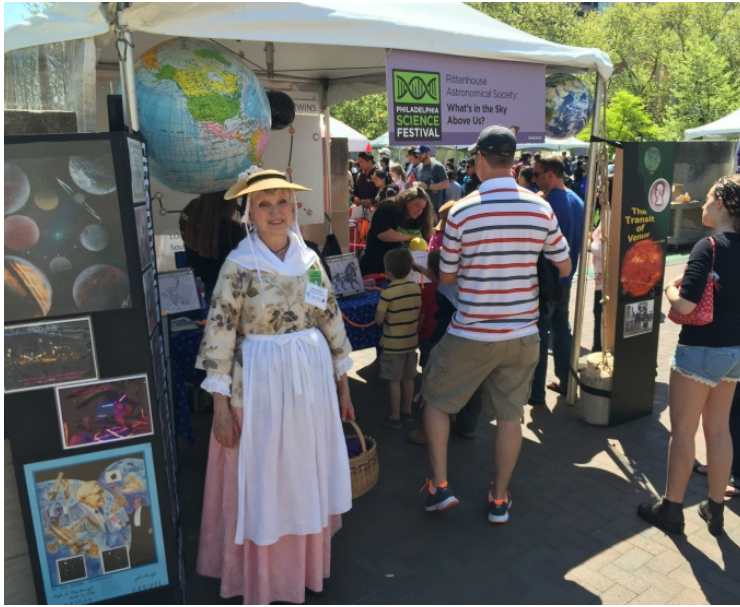
Caroline Herschel visits Rittenhouse Booth at the Festival

Our board of governors have supported and encouraged involvement over the past five years and have pulled together the needed volunteers from our society, to take part in both the telescope night and the parkway carnival. It merits their listing here.