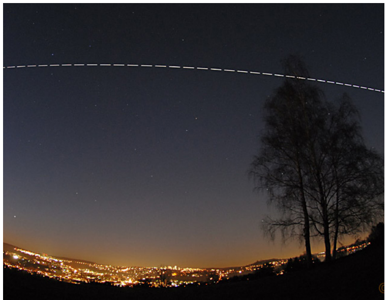
A Similar Look at an ISS pass overhead

We then looked at the moon, nearing first quarter. And, although Jupiter was inviting, we all took a break to watch a 12° ISS pass at 8:48pm. Also easier to see for the kids with their younger eyes, but my green laser made it easier to track in the yellow city glow. I explained to them that it was amazing to be able to see something moving so fast and hundreds of miles up, while it was nearing the coast of Florida! They could also see it's current path / ground track on a little cellphone, and understood why it appeared so low in our sky. Bright, large and high, Jupiter was probably the highlight of the night. Kids were delighted being able to see it and its complex of moons. They peppered me with thoughtful questions, especially about space travel and survival on strange lands. A great night out was had by all!