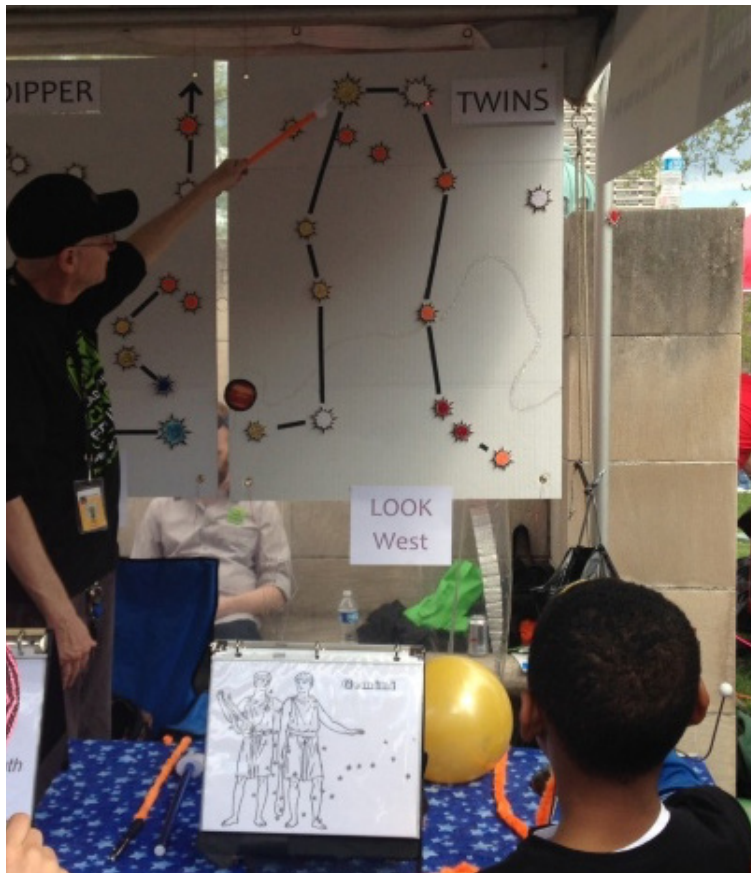
Constellations are the focus during the Science Festival

After participating at the carnival booth, participants were encouraged to view the sun through some of the solar